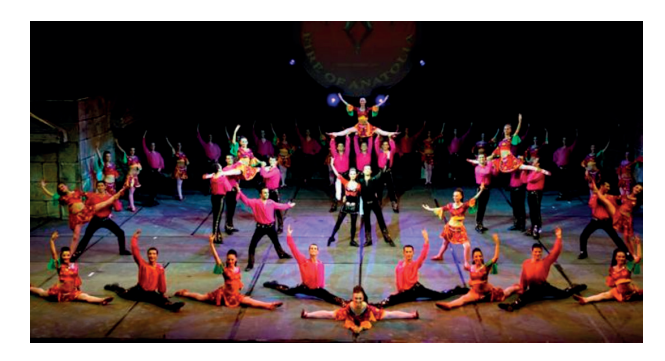
Figure 3. The split figure in the Karsilama dance

Patellar dislocation occurs after twisting the knee due to the valgus stress when the foot is on the ground, right before initiating a turn or jump in the air. The required torque is attained by stepping the "standing" foot on the ground; the leg is rotated according to both the foot and the thigh, and then it is angulated. The rotation and angulation of the leg in respect to the foot and the hip is increased. Several predisposing factors, including femoral trochlear dysplasia, patella alta, and lateralization of the tibial tuberosity, contribute to patellar instability and lat-